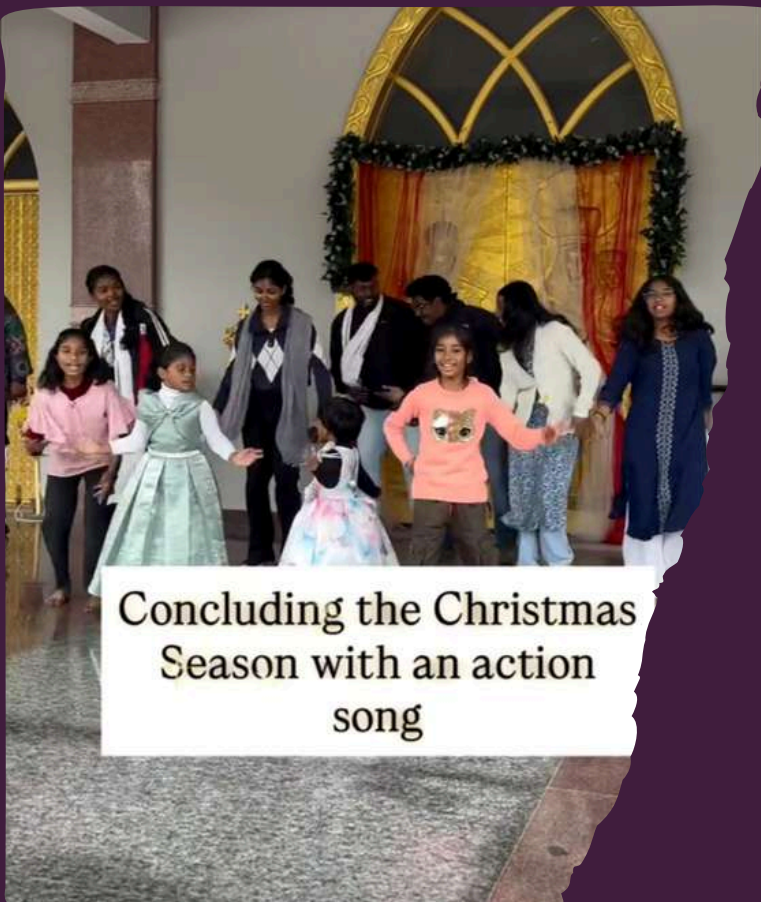
Concluding the Christmas Season with an action song