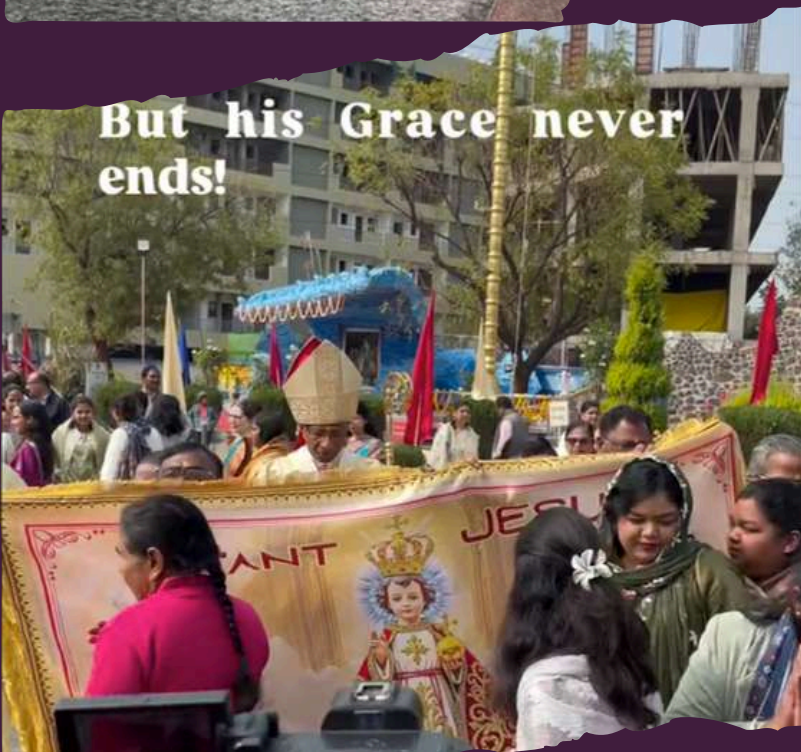
But his Grace never ends!